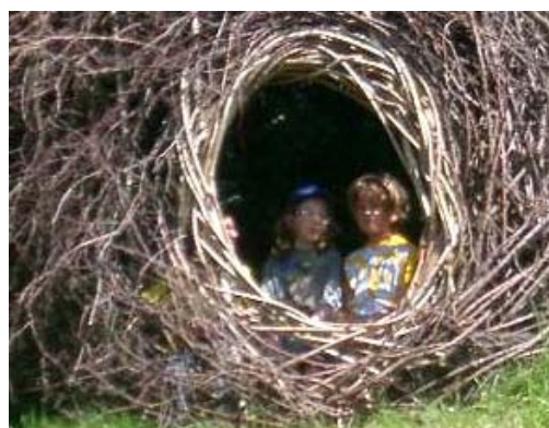
Image from The Carbon Challenge , One Planet Leaders, September 2009

Antony Turner led a climate change and carbon workshop for international executives attending the WWF One Planet Leaders course in Switzerland in September. His stellar performance helped to paint a clear picture of the challenges ahead and the leadership required to return the human race towards living within ecological limits. For input to your event, visit CarbonSense .